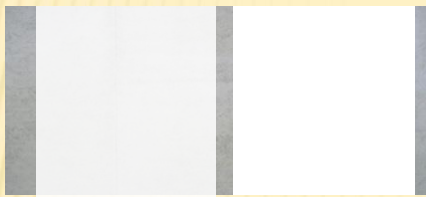
Indonesian Standard paint