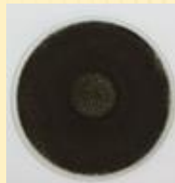
No Anti Mold Type